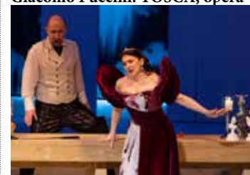
The National Theatre Košice Historical building, Hlavná Street

25 June 19:00 Giacomo Puccini: TOSCA, opera