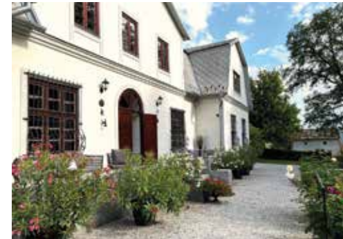
BUSINESS & PRIVATE RESORT