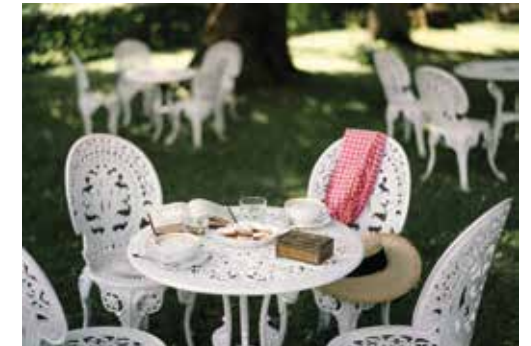
EVENT LOCATION & WEDDINGS