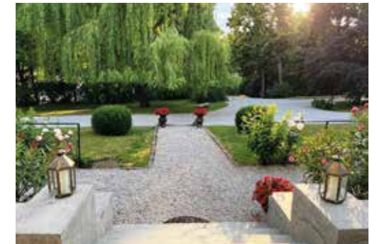
ELEGANCE & LUXURY