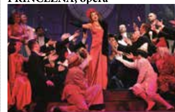
The National Theatre Košice Historical building, Hlavná Street

24 June 18:30 Emmerich Kálmán: CIRKUSOVÁ PRINCEZNÁ, opera